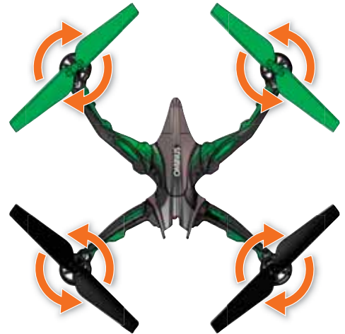
REAR Black Blades, White LEDs