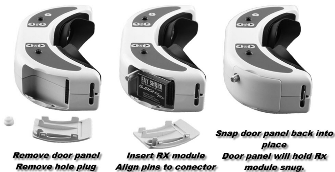
Remove door panel Remove hole plug