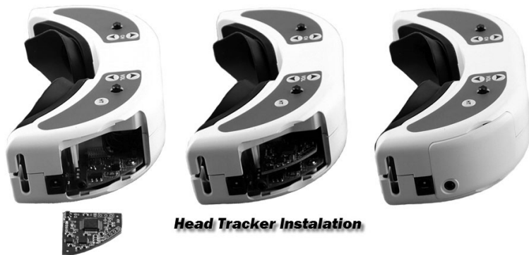
Head Tracker Instalation

Refer to head tracker module manual for up to date and detailed menu setup instructions. For individual radio setup instructions please visit our head tracking support forum at www.FPVlab.com Forum: Sponsors Gate/Fat Shark/Head tracker radio support.